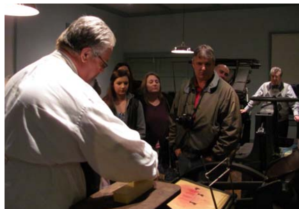
Bookmarks are printed by Charles Futrell and given to visitors at the Village Print Shop.