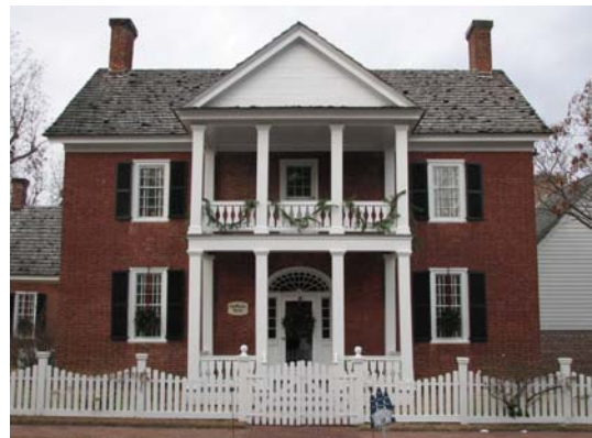
The Wheeler House looks festive for the tour.