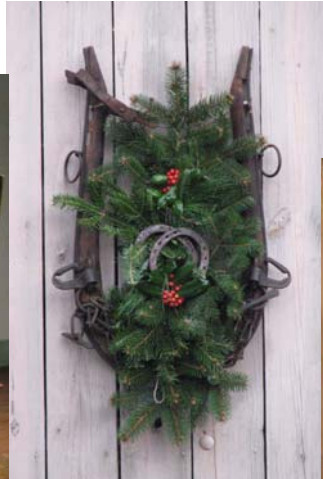
A decoration at the Blacksmith Shop.