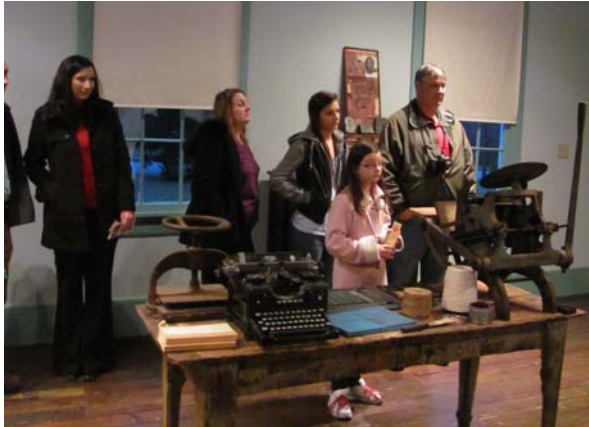
Guests are attentive at the newly opened Print Shop museum.