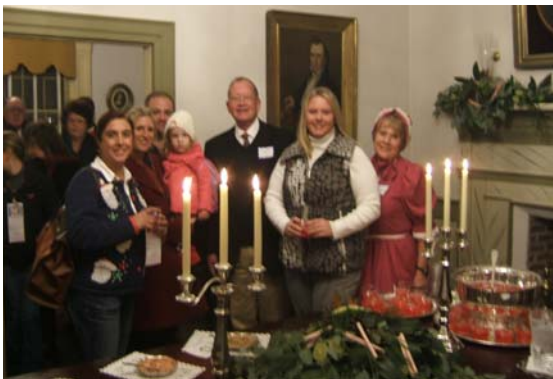
Guests enjoy breads, spreads and punch at the Roberts-Vaughan House.