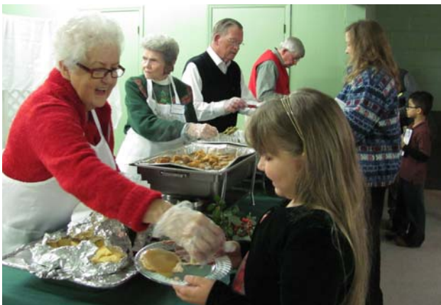
A young guest is served a holiday meal by one of the many MHA volunteers at the Murfree Center.